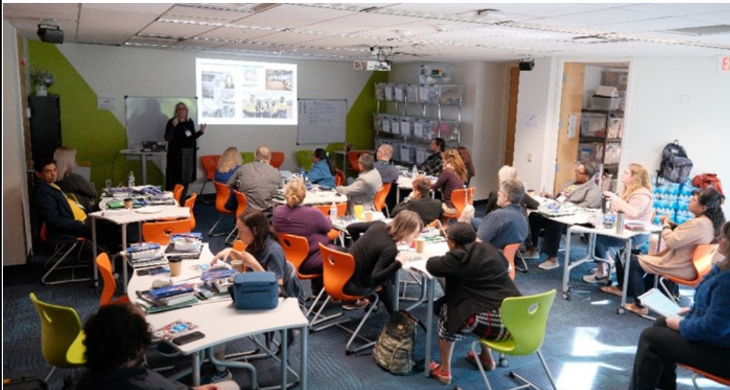
17 Arizona teachers participated in the inaugural Arizona Science Teachers Mining and Mineral Resources Workshop at SME MineXchange 2024 in Phoenix, AZ.

This spring, the outreach program sowed some new initiatives, fertilized continuing programs, and continued presenting throughout Arizona. The outreach team worked hard to support teachers and students in their classrooms, at STEAM events, and with new materials. These developments were all possible thanks to the support of the Mining and Minerals Education Foundation. Read on to discover what