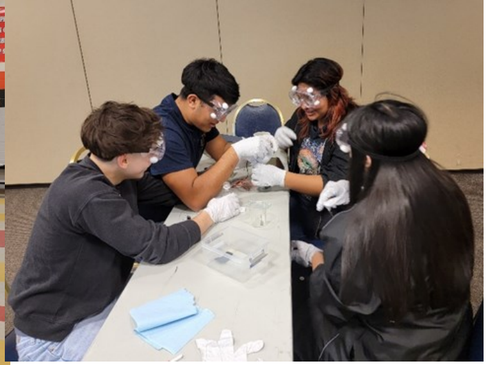
Over 150 High School students from Southern Arizona tried their hand at refining copper during SHPE's Alex Day at the University of Arizona.

Other presentations and events this spring included STEAM nights at various schools from Nogales to Mesa, classroom presentations all over the state, supporting the Society of Hispanic Professional Engineers (SHPE) UArizona student chapter, and running the education table at Mining Day at the Capitol. Support for the program at the state and university levels is growing every day. But it is thanks to the Mining and